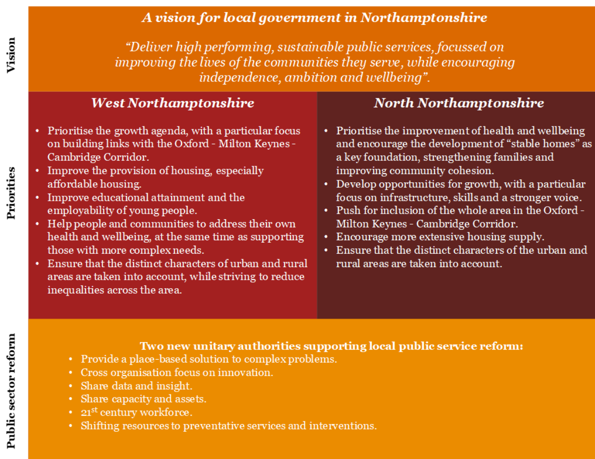
Figure 4: Emerging vision and priorities for the new unitary authorities in Northamptonshire

5.1. The Best Value report’s reference to a ‘new start’ for the residents of Northamptonshire is couched in terms of needing to deliver ‘confidence and quality in the full range of local government services’. The Northamptonshire councils are developing a vision for the future of local government in the county, with emerging emphases for the West and North areas, as shown in the diagram below: