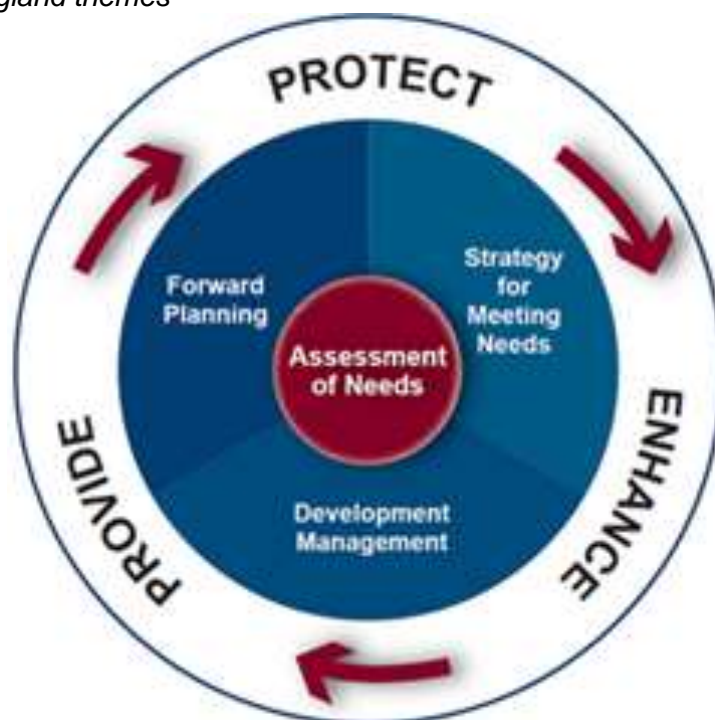
Figure 1: Sport England themes

To provide new playing pitches where there is current or future demand to do so